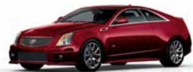
RED OBSESSION TINTCOAT 1